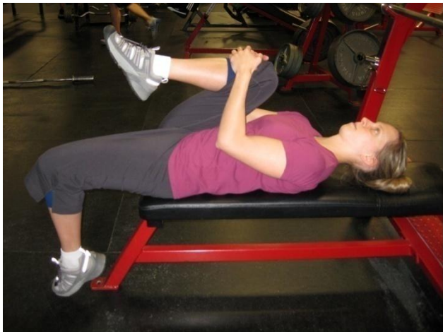
Figure A (balanced iliopsoas)

The result of this? Short hip flexors! How do you know if you have “short hip flexors”? A specific and easy way to tell if your hip flexors are shortened is in the position below. Figure A demonstrates how your leg will rest, when relaxed, if your hip flexors are a balanced length. Figure B is an example of how your leg will look if your hip flexors are shortened.