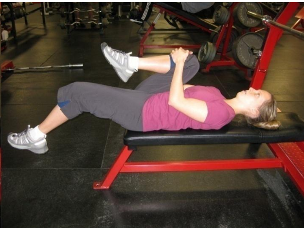
Figure B (short iliopsoas)