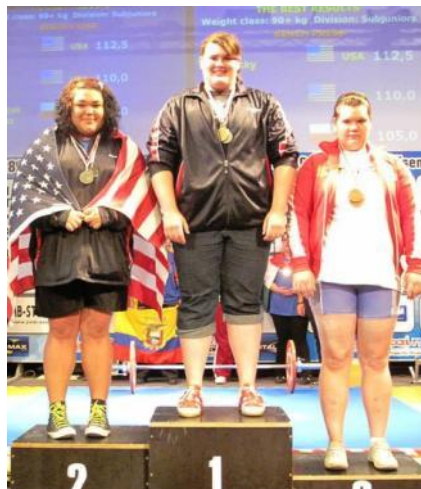
SHWs take Gold & Silver