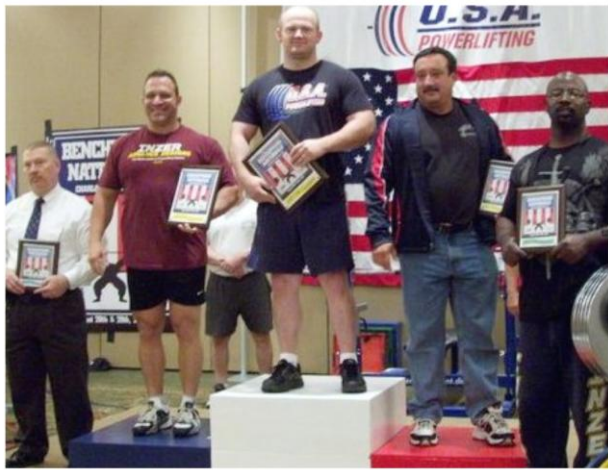
220 Class Winners