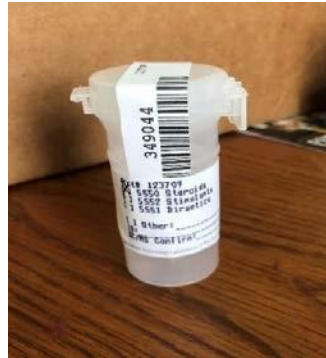
Figure 1 – Applying Stickers to Vials